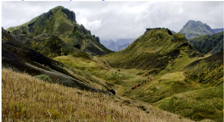
Riders in Thórmörk

P.O. Box 475 Millerton, NY 12546 USA Toll Free 888 686-6784 From Europe 01 518 789-4890 Email: hn@icelandadventure.com